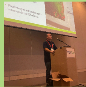
JB Liefert SiteOne